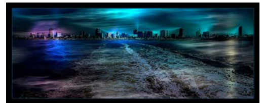
Advanced Open – First Place Wayne Wood