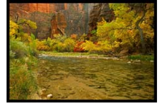
Intermediate 'Scapes – First Place Joel Block