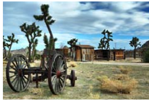
Intermediate Photojournalism – First Place Rich Asman and Isidro Acevedo