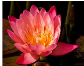
Intermediate Close-Up – First Place Bessie Reece