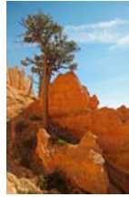
Apprentice 'Scapes – First Place Kathy Posen