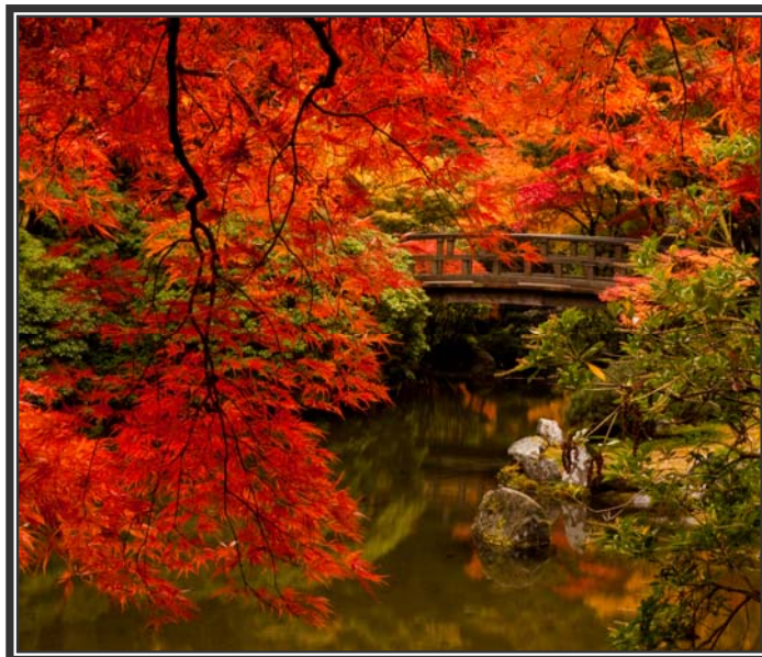
FALL AT THE JAPANESE GARDEN

Dave's Intermediate - Places entry proves you don't have to be in the Advanced category to make great images.