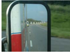
Apprentice Photojournalism – First Place Christy Slattery