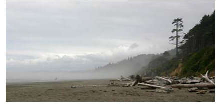
Apprentice Places – First Place Karen Coates