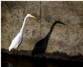
Intermediate Animal – First Place Jerry Reece