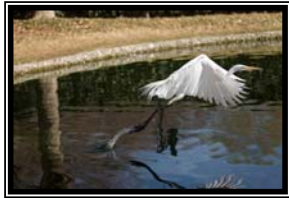
Animal – First Place Donald Haggart

Share Your Work: 300 ppi JPEG; no larger than 5" x 5"