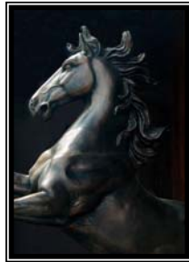
Open – First Place Bessie Reece