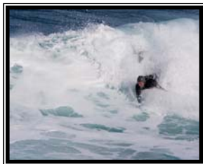
Photojournalism – First Place Joe Niehus