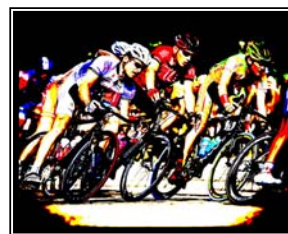
Open – First Place Julie Furber