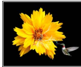
Close-Up – First Place Wayne Wood