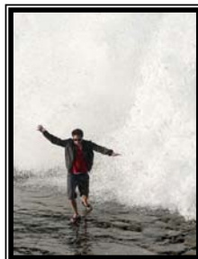
Photojournalism – First Place Bruce Bonnett