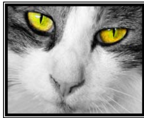
Animal – First Place Wayne Wood