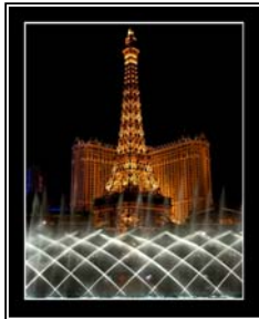
Places – First Place Shaun Karsemeyer