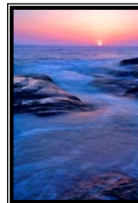
Places – First Place Patrick Flood