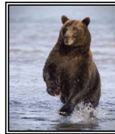
Intermediate Animal – First Place Julie Furber