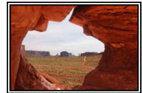
Intermediate Places – First Place Russell Trozera