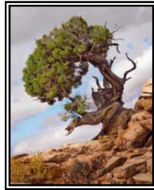
Apprentice Open – First Place Bessie Reece