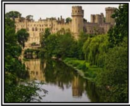
Apprentice Places – First Place Bessie Reece

Share Your Work: 300 ppi JPEG; no larger than 5" x 5"