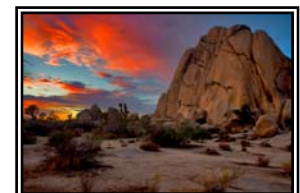
Advanced Open – First Place Patrick Flood