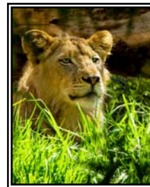
Apprentice Animal – First Place Bessie Reece