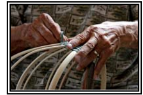
Apprentice Photojournalism – First Place Dave Cochrane