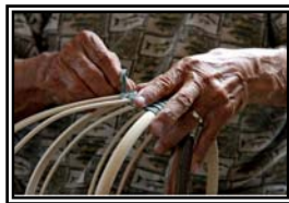
Intermediate Photojournalism – First Place Dave Cochrane