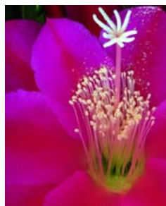
In Cidni's Garden Dan Griffith