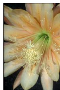
Peach Epie Lois Behrens