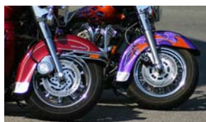
Hot Wheels Christine French