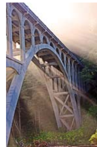
Hwy 1 Bridge