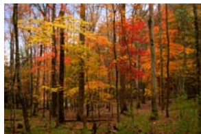
Smokies Fall Jerrv Reece