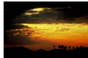
Redlands Sunset Scott Gutentag