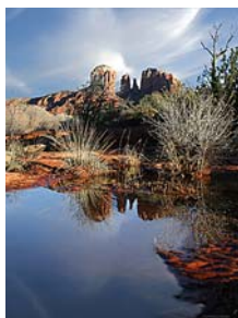
Reflections Bruce Bonnett