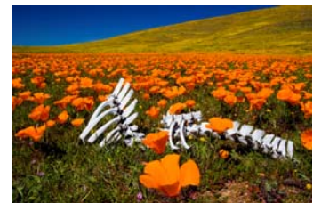
Best Of Show Poppies And Bones by Patrick Flood

(see next page; due to space constraints, HMs are not listed). Lastly, congratulations to everyone who entered. Your enthusiasm for photography clearly showed in your work!