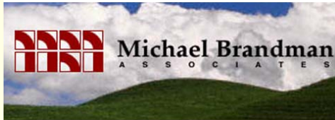
EXHIBIT LOCATED AT

Michael Brandman Associates is located at 621 E. Carnegie Drive, Ste. 100 San Bernardino, CA 92408. Exhibition opens from 8 AM through 6 PM, Monday - Thursday.