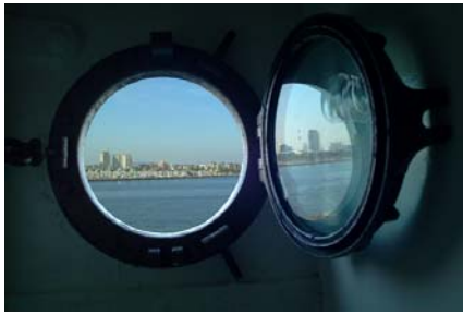
Porthole Reflection Fred Nicoloff