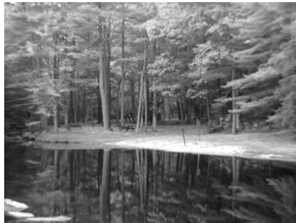
Quiet Place Dale Showman