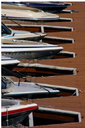
Boats