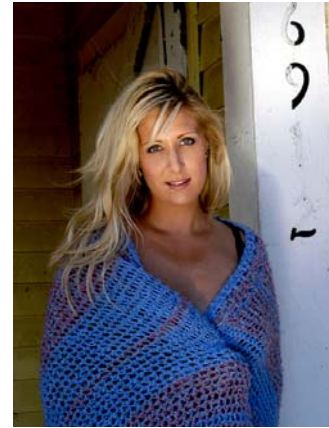
Numerology Cami Cloe Oetman