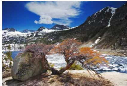
South Bishop Lake Patrick Flood