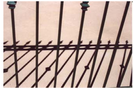
Repetition Monique Harmon