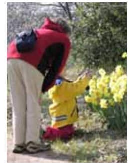
Starting Early Char Sveen