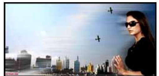
South Beach Flat Marc Piron