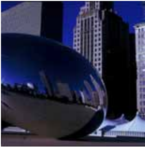
Bean Part 1 Ralph Solis

Members are encouraged to submit their images for inclusion on a space-available basis. Images must be 300 dpi JPEG, no larger than 5"x 5". See Photogram Submissions box for deadline and submission information.