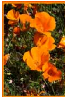
Poppy Bouquet Bessie Reece