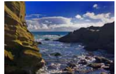
Laguna Moss Patrick Flood