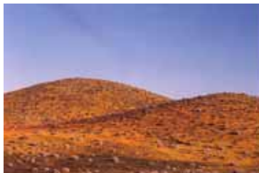
Fields Of Color Monique Harrmon